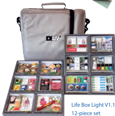
Life Box Light V1.1 12-piece set £499. 00 + p&p & VAT

For more information visit www.dandwp.com