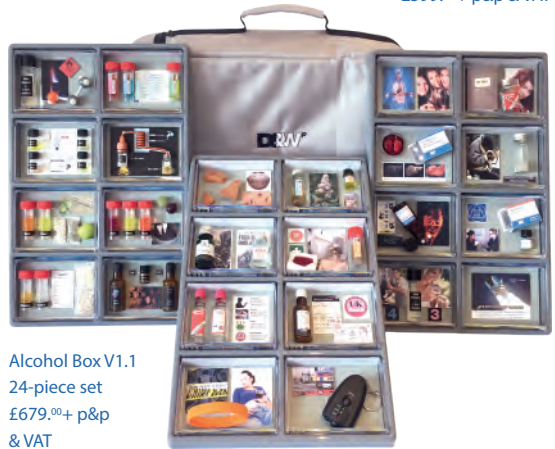
Alcohol Box V1.1 24-piece set £679.00+ p&p & VAT

The D&Wp Alcohol Box is a 3D presenter of Alcohol issues. The New durable and lightweight carry case securely stores three trays in which there are (up to) 24 crystal cases containing intricately handmade 3D models. Subjects covered include; What is Alcohol?, Types of Alcohol, History of Alcohol, Control of Alcohol, Health Risks and Solutions.