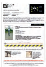
Walk the Line