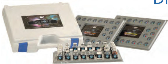
S.I.D. Box V2.1 £569.00+p&p & VAT