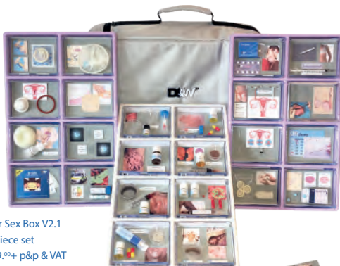
Safer Sex Box V2.1 24-piece set £759. 00 + p&p & VAT

The D&Wp V2 Safer Sex Box enables trainers to overcome the difficulty of using substances which carry or have a biohazard such as blood, medicines and prescription devices.