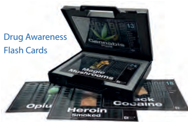
Drug Awareness Flash Cards

Flash Cards Sets 1 & 2 £139.00 each +p&p & VAT