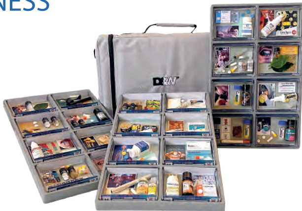
Drug Box V5.2 - 21-piece set £599.00 24-piece set £679.00 + p&p & VAT

An increase in the abuse of Fentanyl (Synthetic Heroin, 50 x stronger than regular Heroin), the introduction of THC Edible Jellies as an alternative to smoking herbal cannabis or cannabis resin and an increase in the use of Nitrous Oxide (N.O.S. - laughing gas) in connection to solvent abuse prompted D&Wp to release the D&Wp Drug Box Version 5.2 which includes these updates.