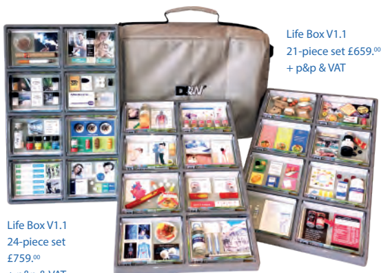
Life Box V1.1 21-piece set £659. 00 + p&p & VAT