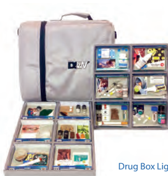
Drug Box Light V5.2 12-piece set £469.00 + p&p & VAT

For more information visit www.dandwp.com